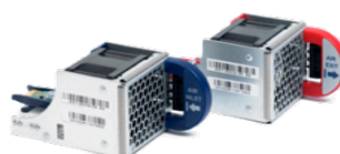
Hot swap fan modules