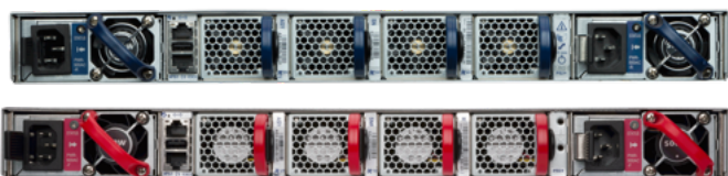
7280R 1RU Rear View: Rear to Front and Front to Rear