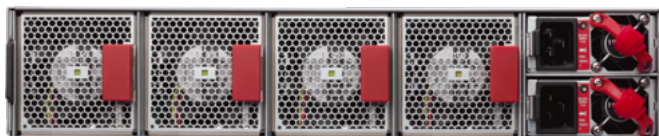
Arista 7280R 2RU Rear View: Front to Rear air flow (red)