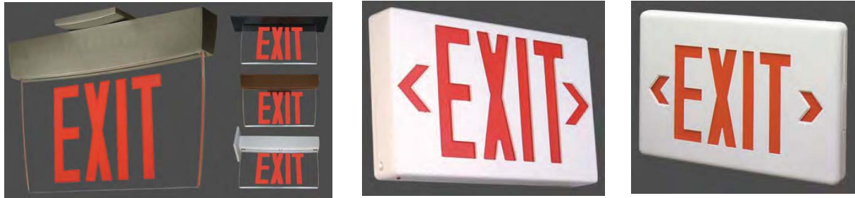
Figure 2-3. Typical Egress Marking Units

Typical Energy Star Egress Marking Units with a 10-year Manufacturer's Estimated Service Life Battery