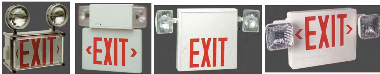
Figure 2-4. Typical Combination Egress Marking and Emergency Light Units

Typical Combination Egress Marking and Emergency Light Units with a 5-year Manufacturer's Estimated Service Life Battery (not Energy Star compliant)