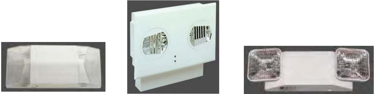
Typical Emergency Light Units with a 5-year Manufacturer's Estimated Service Life Battery