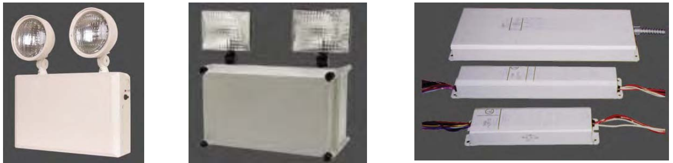
Typical Emergency Light Units and Florescent Fixture Ballasts with a 10-year Manufacturer's Estimated Service Life Battery