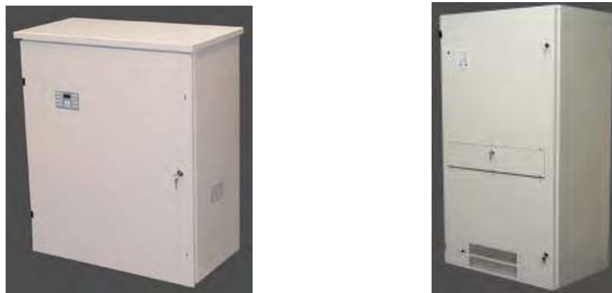
Typical Central Emergency Power Sources with a 10-year Manufacturer's Estimated Service Life Battery