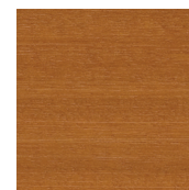
HONEY TEAK ATOHTQ / ATOHTG