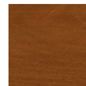
JARRAH BROWN ATOJBQ / ATOJBG