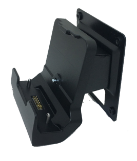
G8s VESA Mount Charger