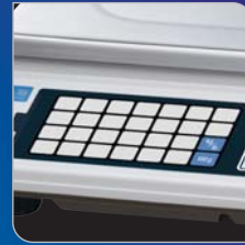
28 preset price keys