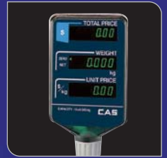
Three high-legible VFD display