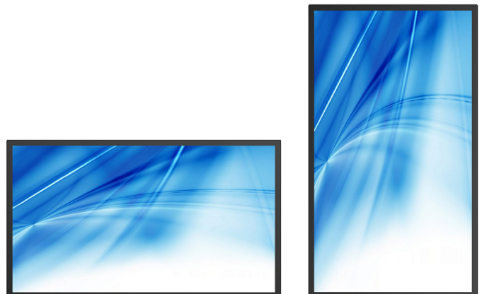
LANDSCAPE AND PORTRAIT SCREEN OPTIONS