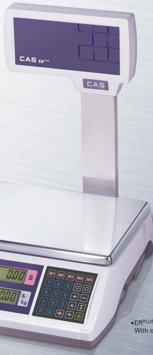
◀ ER PLUS ; With client pole display