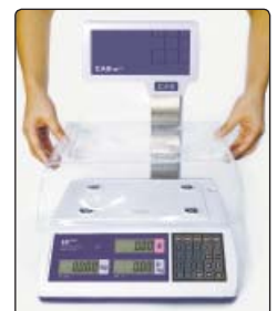
▲ Dust Protection Cover