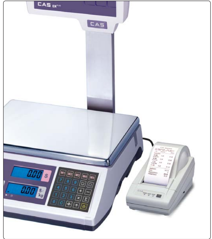
▲ Sample of a Ticket