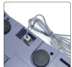
▲ RS-232C Interface