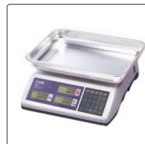
▲ Fish Tray