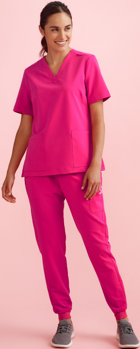
Matching scrub top CST245LS available