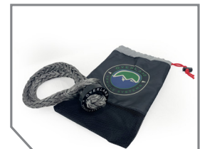
STORAGE BAG INCLUDED