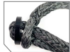
2.5" BLACK STEEL COLLAR