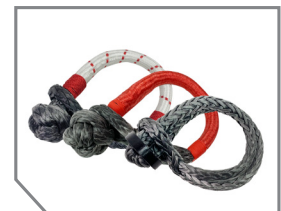
LIGHTWEIGHT DYNEEMA SYNTHETIC FIBER