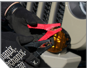
POWER CABLES WITH ALLIGATOR CLIPS