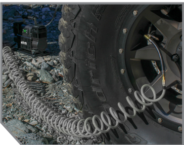
24” COILED HIGH-QUALITY HOSE