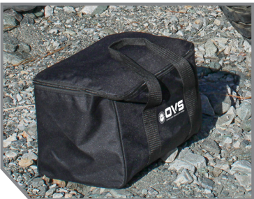
BALLISTIC NYLON STORAGE BAG INCLUDED