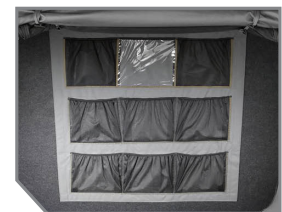
OVERHEAD INTERNAL STORAGE OPTIONS