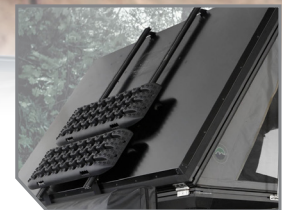
SET OF 2 CROSSBARS INCLUDED