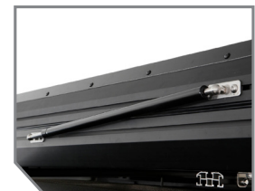
NITROGEN GAS CHARGED STRUTS