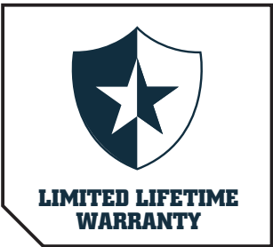
LIMITED LIFETIME WARRANTY