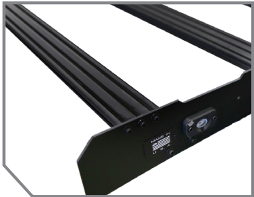
ADJUSTABLE ALUMINUM CROSSBARS