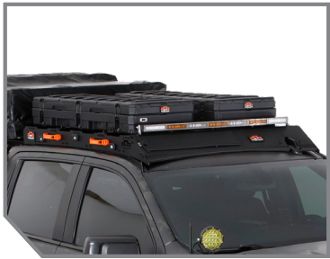
FITS CABS OF MID SIZE AND FULL SIZE TRUCKS