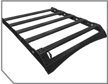
11-PIECE MODULAR ROOF RACK

Maximize your vehicle's carrying power with the Ruff Roof Rax. Lightweight aluminum construction, modular design, and rugged performance built for every adventure.