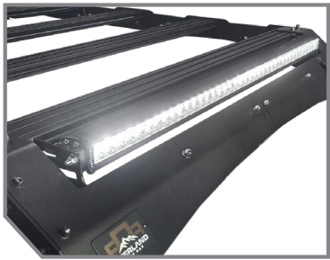
LIGHT BAR COMPATIBILITY