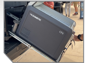
TILT MECHANIC TO MAKE FRIDGE EASY TO REACH