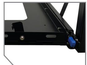
EASY TO USE LOCKING MECHANISMS