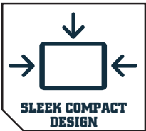
SLEEK COMPACT DESIGN

The Refrigerator Tray operates as a straight pull out slide, and it has the option to tilt. This means you have the advantage of a fridge slide that runs on stainless steel runners. This product offers maximum strength with the ability to carry greater loads, with greater resistance to dust and the harsh off-road conditions. With double locking pins, it is secured firmly in place when locked in position – with no risk of the fridge slide breaking free when the road gets rough.