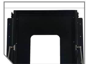
DURABLE WEATHER RESISTANT COATING