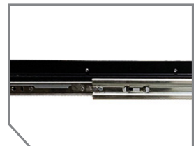
STAINLESS STEEL RUNNERS WITH SEALED BEARINGS