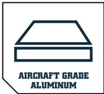
AIRCRAFT GRADE ALUMINUM