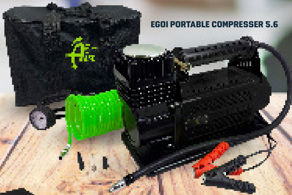
EGOI PORTABLE COMPRESSOR 5.6