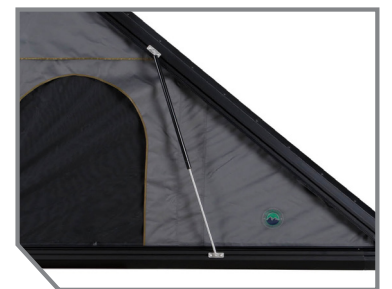
NITROGEN GAS CHARGED STRUTS