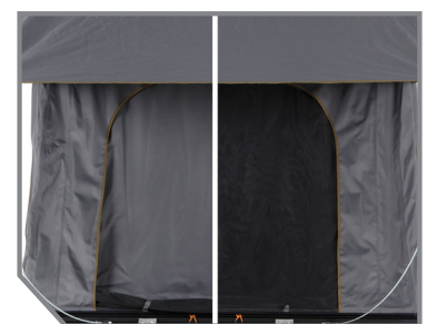
120G BREATHABLE MESH WINDOW SCREENS