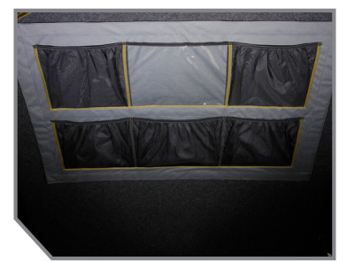
6 OVERHEAD INTERNAL STORAGE OPTIONS