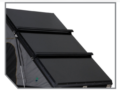
SET OF 2 CROSS BARS INCLUDED

Engineered for strength, speed, and comfort, the Mamba sets the standard for premium hard shell rooftop tents. Its aerodynamic aluminum design, gas strut assist, and plush interior make setup effortless and every adventure unforgettable.