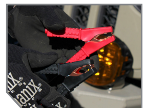
POWER CABLES WITH ALLIGATOR CLIPS