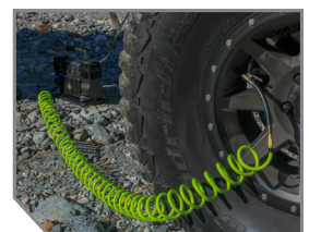
24" COILED HIGH-QUALITY HOSE