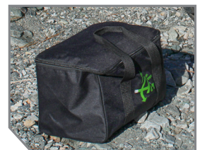
BALLISTIC NYLON STORAGE BAG INCLUDED