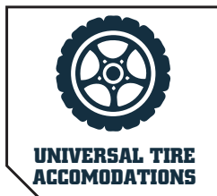
UNIVERSAL TIRE ACCOMMODATIONS