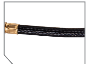
REINFORCED NYLON WRAPPED AIR-LINE