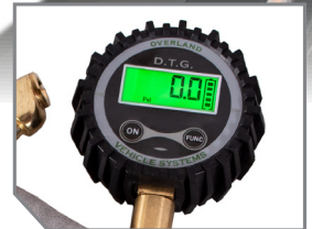
HEAVY DUTY RUBBER PROTECTIVE COVER

The Digital Tire Gauge is a durable, easy-to-use tool with an oversized, illuminated display and a heavy-duty rubber protective cover. Made with anti-rust brass and stainless steel components, it features a reinforced nylon wrapped airline and a quick-connect valve stem attachment. Each gauge includes a valve stem repair kit and comes in a heavy-duty storage bag for secure and organized storage.