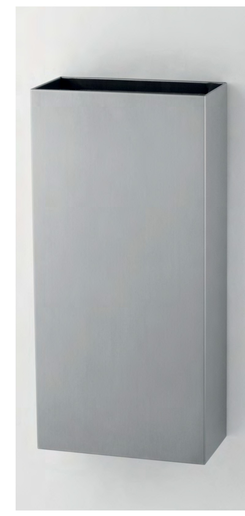
Towel Dispenser B-9262