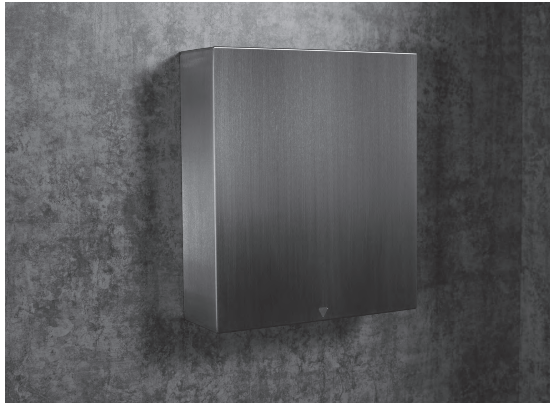
Hand Dryer B-7179