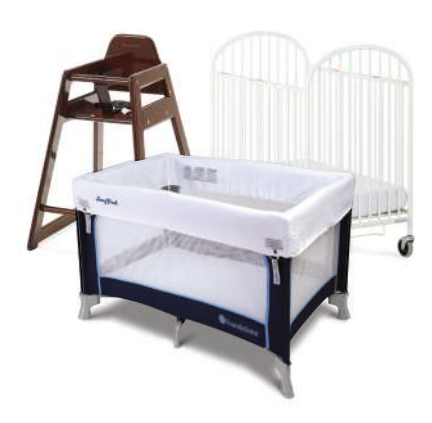
WORLD LEADER IN HOTELS™

Foundations<sup>®</sup> is the global leader in commercial children's furnishing in child care centers, hotels and public washrooms where safety, quality and convenience are paramount.