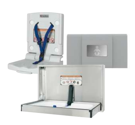
BABY CHANGERS MADE BY BABY EXPERTS™