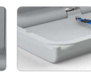
Dual bag hooks easily accommodate thick diaper bags