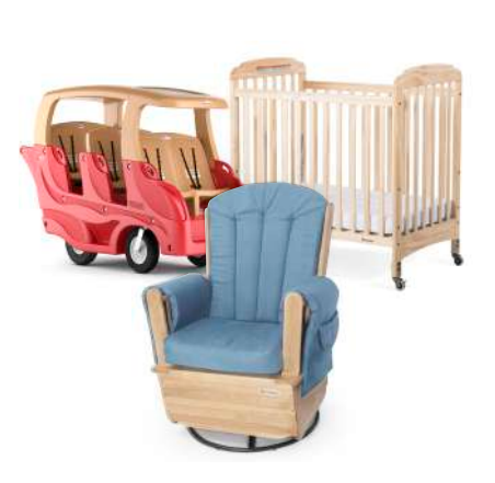
MOST TRUSTED NAME IN CHILD CARE™