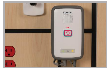
Audible and visual feedback confirms desired alarm settings and when an individual is actively being monitored.

Medical Technologies Int. is an authorized Sales Partner for Stanley Healthcare. For more information on this product or other Fall Management and Patient Safety products contact our office.