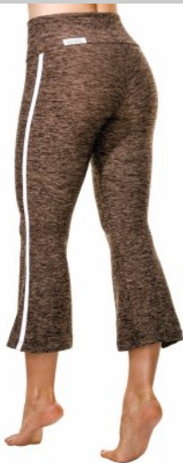
9303-SB Flow High Waist 3/4 Flare Leggings Supplex Contrast on Butter