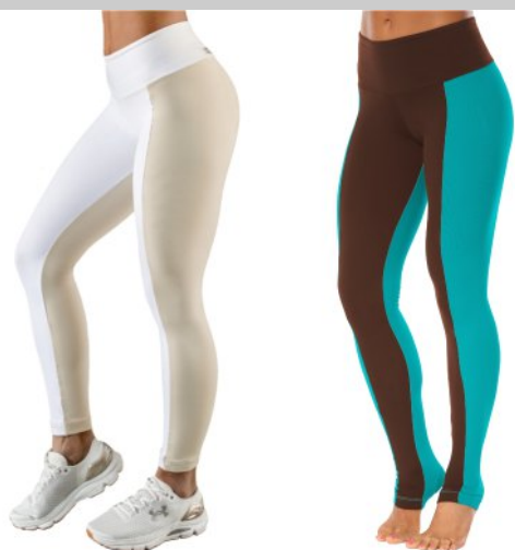
9166 High Waist Sabé Leggings