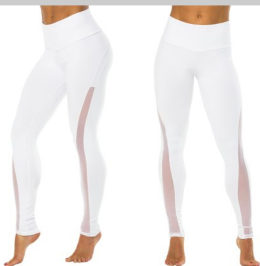
9264 High Waist Solstice Leggings Mesh Accent on Supplex