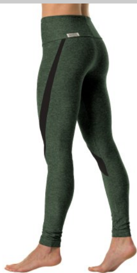
9290-SB High Waist Victoria Leggings Supplex Accent on Butter