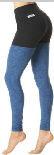
9181-SB Power High Waist Supplex/Butter Leggings