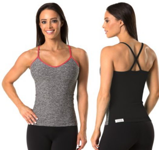
7302-SB Laya Top Supplex on Butter