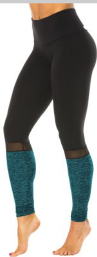
9225 High Waist Salia Leggings Mesh Accent on Supplex/Butter