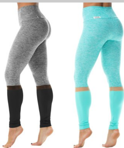
9192-SB High Waist Elevate Leggings Mesh Accent on Butter/Supplex