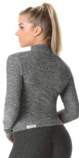
7191-B Eli Jacket