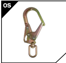
Steel Swivel Mini Rebar Hook