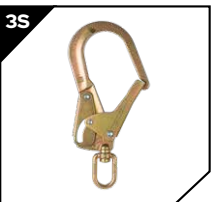
Steel Swivel Rebar Hook