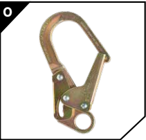
Steel Mini Rebar Hook