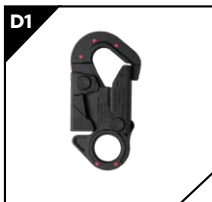
Dielectric Snap Hook