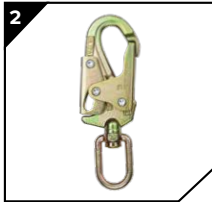
Steel Swivel Snap Hook