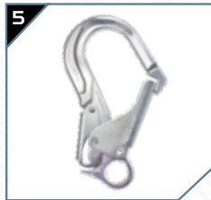
5 Aluminum Rebar Hook