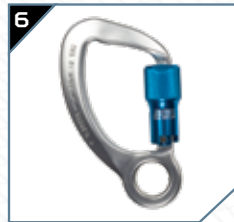
6 Aluminum Carabiner