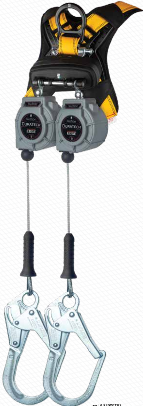
part # 83909TP3

DuraTech® Personal Leading Edge Self-Retracting Lifelines deliver cutting edge performance and unrivaled results through sensible design and precision engineering resulting in greater user versatility and productivity.