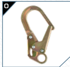
0 Mini Steel Rebar Hook

All rebar hooks feature Transverse Load rated gate strength.