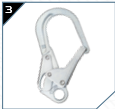
3 Steel Rebar Hook