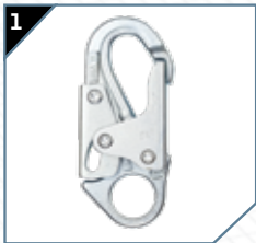
1 Steel Snap Hook