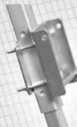
7291B Leg Bracket