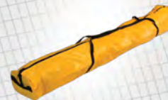
NL7282 Tripod Bag