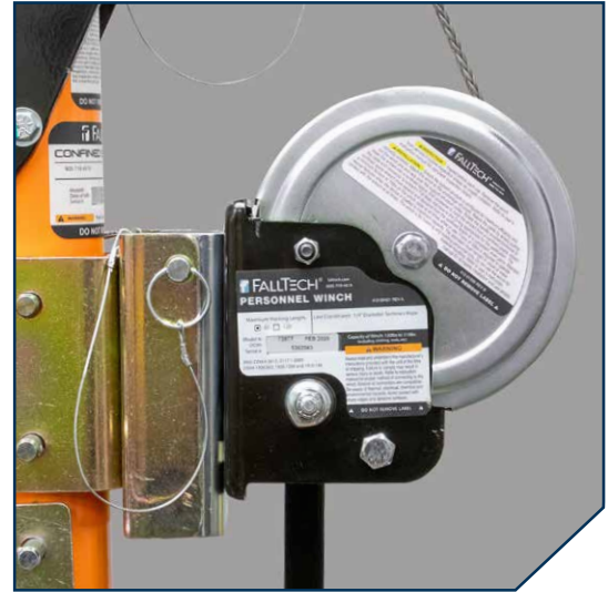
Technora® Rope Personnel Winch mounted on a Davit System (6050128)