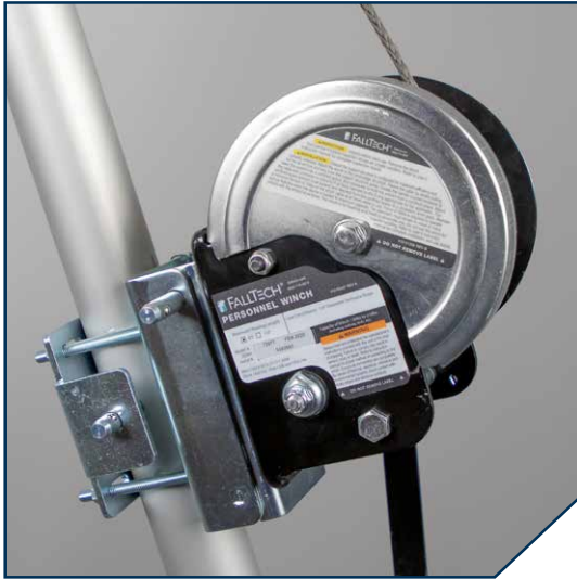
Technora® Rope Personnel Winch shown mounted on a Tripod System (7275)