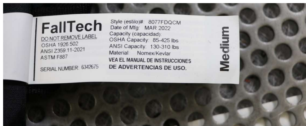
Figure 3.1: Identification Tag