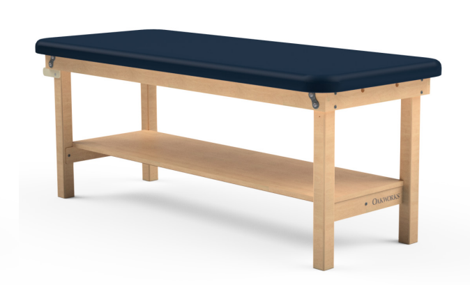
Sapphire fabric, Natural Finish and optional storage shelf