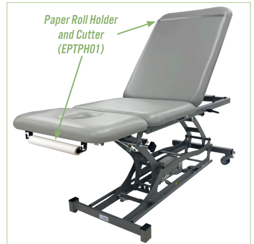
Paper Roll Holder and Cutter (EPTPH01)