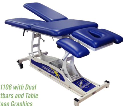
PT1106 with Dual Footbars and Table Base Graphics