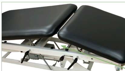
Manual Elevating Midsection (S1135)