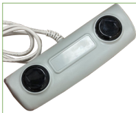
Dual Foot Control Pedal (x2) (S1077)