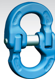
C Connex Connecting Link