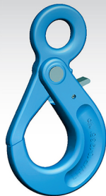
LH Safety Hook