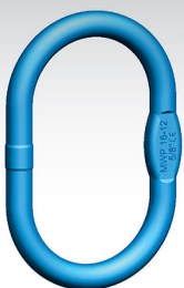
M Enlarged Master Link