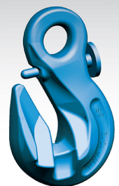
PS Grab Hook with Safety Pin