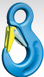
HS Eye Sling Hook