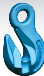
P Grab Hook