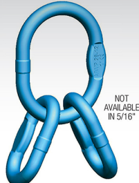
VM Enlarged Master Link Assembly