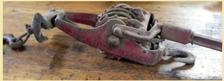
A 1947 More Power Puller® – still in use!

The design of The More Power Puller® hasn't changed much in over 81 years (why change a good thing?). This puller will last for generations. We regularly service pullers that are several decades old, and often, all they need is a new cable or spring. We are confident you will find The More Power Puller® to be a reliable, safe and heavy duty tool that will prove to be indispensable.