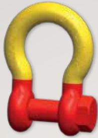
No. 264 Screw Pin Shackle Pin Hex Head Available 1/2" - 2"