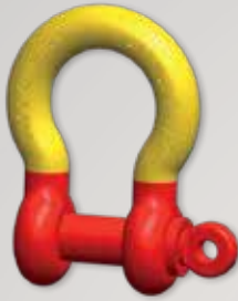
No. 263 Screw Pin Shackle Eyed Pin Available 1/2" - 3"