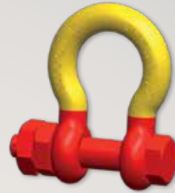
No. 330 Towing Shackle Double Nut with Locking Bolts Available 7/8" - 4 1/2"