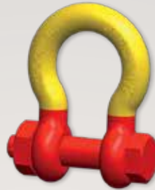
No. 320 Safety Pin Shackle Available 1/2" - 4 1/2"