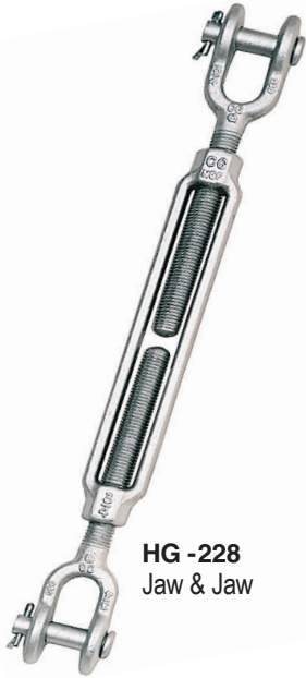
HG-228 Jaw & Jaw

Meets the performance requirements of Federal Specifications FF-T-791b, Type 1 Form 1 - CLASS 7, and ASTM F-1145, except for those provisions required of the contractor. For additional information, see page 452.