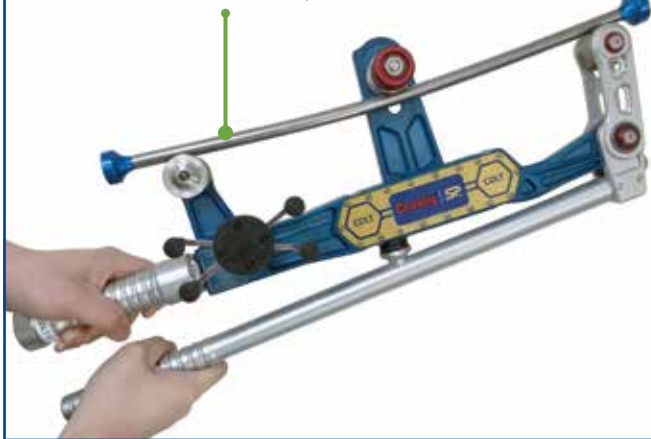
CVT (Calibration Verification Tool)

Specifications assume COLT used on a wire rope with a fixed and flexible end