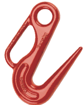
A-378 SORTING HOOK