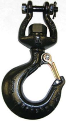
S-3316 REPLACEMENT HOOK