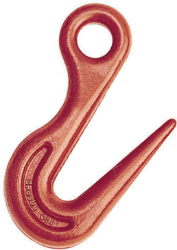
A-378 SORTING HOOK

*Ultimate Load is 5 times the Working Load Limit.