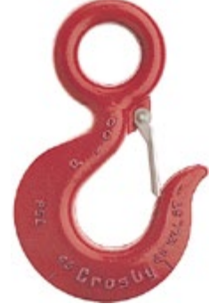
L-320C Frame Size O-T