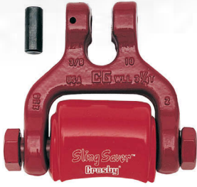
S-282 WEB/CHAIN CONNECTOR

Designed around the same concept as our S-280 Web Connector, the S-282 Chain Connector makes the connection from your web sling to existing chain quick and easy.