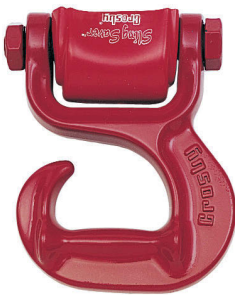
S-287 CHOKER HOOK

* NOTE: Designed for use with Type III, (Eye & Eye), Class 7, 2 Ply web slings. † Maximum Proof Load is 2 times the Working Load Limit. Minimum Ultimate Strength is 4 times the Working Load Limit.