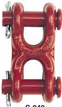
S-249 Twin Clevis Link

Not Suitable for use with Grade 80 or Grade 100 chain and chain slings used in overhead lifting.