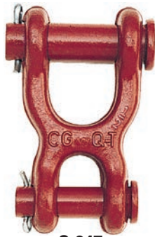
S-247 Double Clevis Link