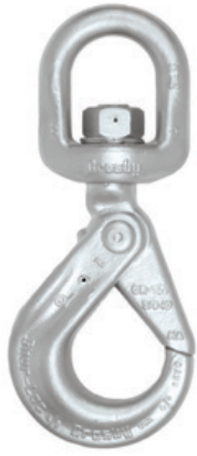
S-1326 SWIVEL HOOK