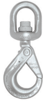
S-13326 SWIVEL HOOK with BEARING