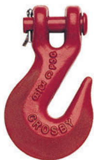
H-330 / A-330 Clevis Grab Hook