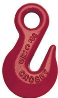
H-323 / A-323 Eye Grab Hook

* These A-330 hooks are forged with an "8" designating Grade 80, and are suitable for use with Grade 8 chain in overhead lifting applications as long as hook is proof-tested as part of the chain sling assembly or as an individual component per ASME B30.9. We recommend the use of the A-338 which is proof tested and supplied with a proof test certificate