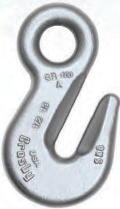
A-1328 Eye Grab Hook