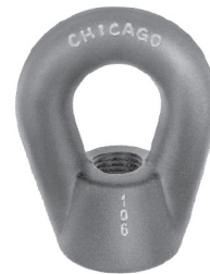
Drilled & Tapped