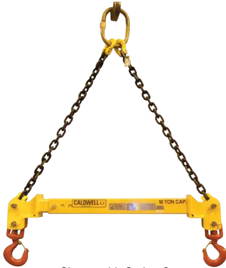
Shown with Option C