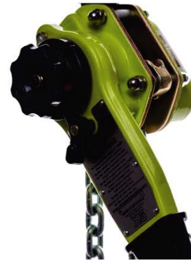
Oversized laser etched stainless steel nameplate with required ASME/OSHA WARNINGS