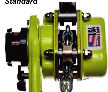
Open chain guard allows visual inspection and does not trap contamination.