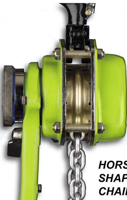
HORSESHOE SHAPE CHAIN GUIDE